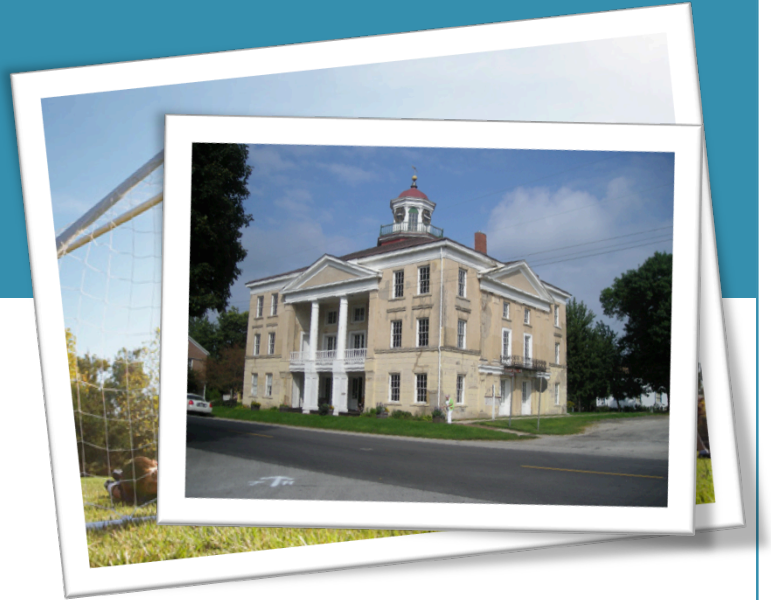
Bishop Hill Historical Society is housed in this building on 3 floors.

Please send Backfire articles or items of interest to: